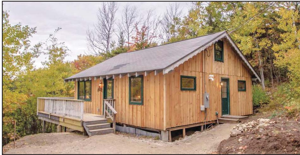
AFTER: We reconfigured the front elevation that made it obvious where the front door should be. This included a larger window, extending the front porch under the new door and relocating the electric meter to the side of the house.