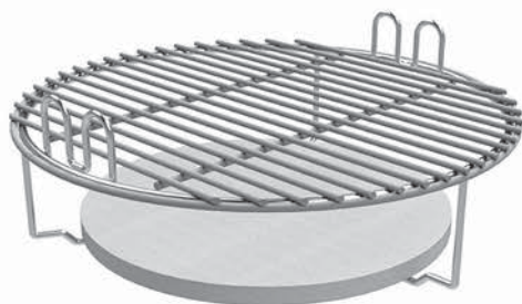
EGGSPANDER convEGGtor basket and baking stone