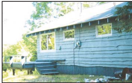
BEFORE: A typical example of a camp cottage a client recently purchased. There was no formal front door facing the road.

There was more than once early on in my career that clients called me after the fact and said, "We should have gone with you, we tried to do it ourselves and we